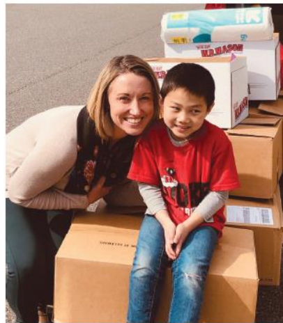
Cooke Elementary teacher and student with “100th Day” donations

Through both events, children and their parents learned more about