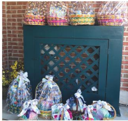
Easter baskets donated by supporters

STEHM's dedicated and expert staff has managed to keep our Martha Houses running smoothly and, most importantly, safely. Government restrictions and social distancing guidelines required us to halt new admissions, but existing residents were able to continue sheltering in place. We have provided the homes with the necessary hygiene products and sanitation guidelines to ensure that our residents are fully equipped with the tools they need to keep themselves, and each other, safe. Staff has been alternating their hours in order to further restrict the number of persons in the homes at any one time.